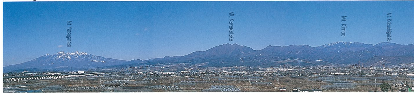
This photograph was taken near the Chubu-Odan Expressway's Shirane Interchange

Yamanashi Prefecture is surrounded by steep mountains: to the northeast is the Chichibu Mountain Range; the Akaishi Mountains (Southern Alps) lie to the west at approximately 3,000 meters above sea level. In the south is Mount Fuji, a World Heritage site, at 3,776 meters; and vast plains spread out to the bases of Mount Yatsugatake and Mount Kayagatake in the north. Many of these mountainous regions, rich in scenic forests, lakes, and valleys, have been designated as Natural Parks, such as the Fuji-Hakone-Izu National Park.