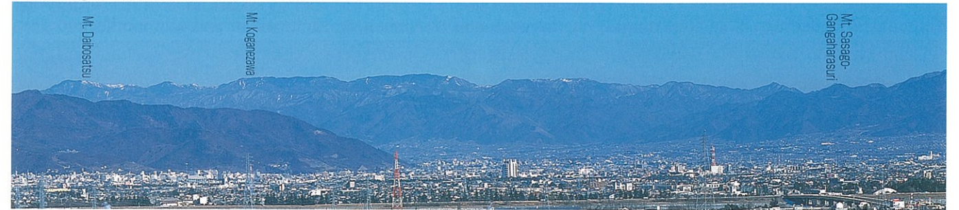
This photograph was taken near the Chubu-Odan Expressway's Shirane Interchange.