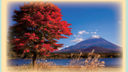
Mt. Fuji (the Parent) Mt. Omuro (the Child)