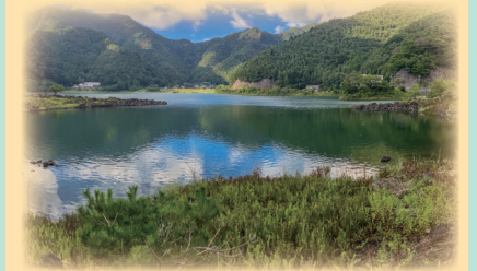
Lava Flow on the Shore of Lake Shojiko