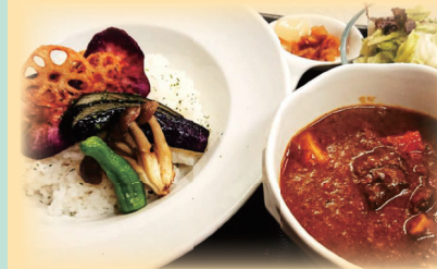
The New Specialty: Venison Curry