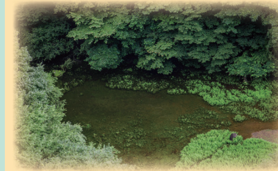
Sixth Fuji Lake (Appearing only rarely)